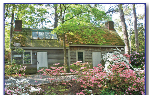
A beautiful springtime view of RAL's Paynter Studio.

Creative space is another aspect of RAL. "We offer open studios in a very organic studio setting. Artists can work on our kilns, easels, and learn from each other in a community environment."