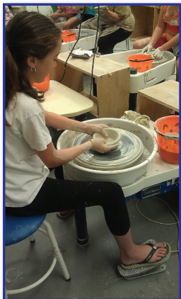
A student at the pottery wheel at a RAL class.