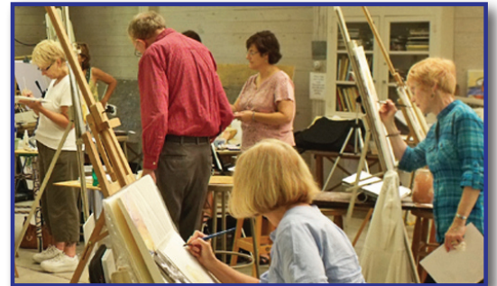
Artists create at RAL's Chambers Studio Painting class.