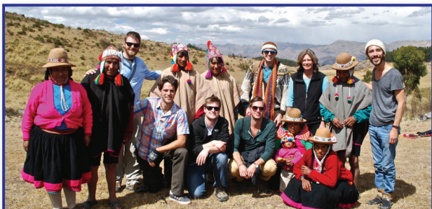
The Travel Songs Project with the Q'eros of Peru

Humenik was next in Tunisia during the Arab Spring of 2011. "I was a photojournalist, chronicling the revolution and daily life." On visits home, he was troubled by the misperceptions of the Arab World. "People I respected had a close-minded view." He continues, "I wanted to show Americans that other cultures are interesting. As a practicing musician, I felt I could use music to make those cultural connections." The Travel Song Projects was born.