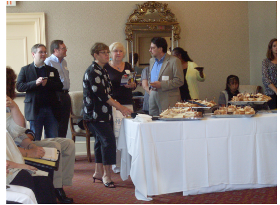
Perspective of Kent County Meet and Greet at the Schwartz Center for the Arts on Sept. 27, 2011.

will work to identify the tangible and intangible messages around these themes and begin to put together a strategy for reaching the intended audiences.